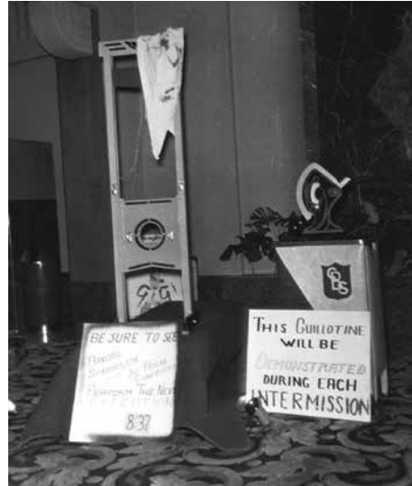
Opening of Macumba Love with guillotine in the lobby