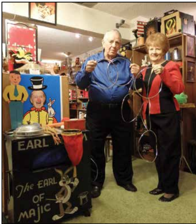
Earl Reum Collection

collection grew, Bruce and Kitty purchased more shelf units upon which to display the newly acquired props. Repeating that process, over and over, as batches of magic became available, resulted in a collection of magic grouped by the person who previously owned it.